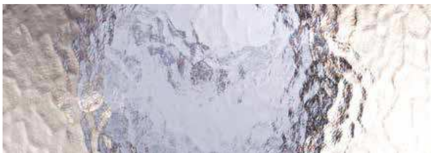
Minster™ Privacy Level 2