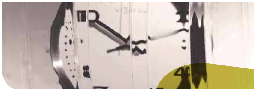
Warwick™ Privacy Level 1

To discover more about the use of Warwick™ please visit our website