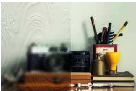
Privacy Level 3