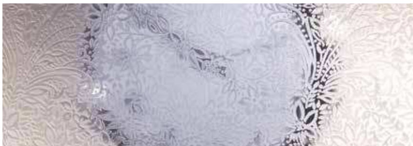
Chantilly™ Privacy Level 2