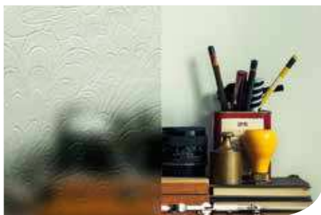
Privacy Level 5