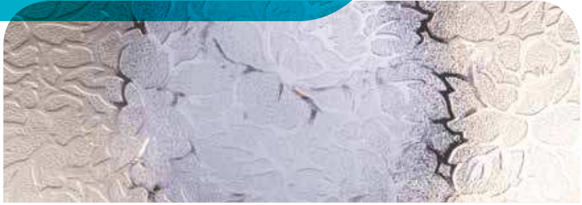
Florielle™ Privacy Level 4