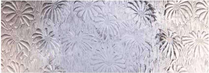
Mayflower™ Privacy Level 4