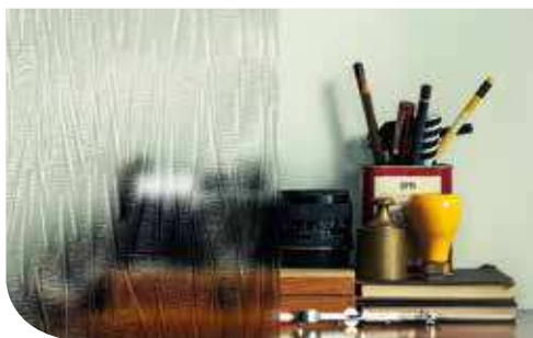
Privacy Level 4