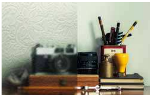
Privacy Level 2