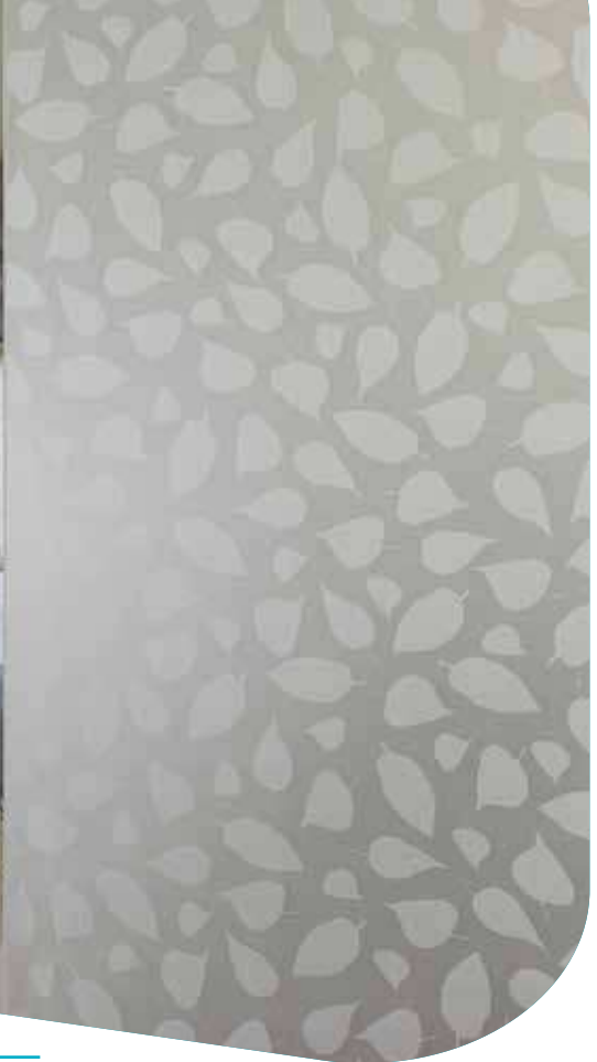
Bay™ Opal Privacy Level 5