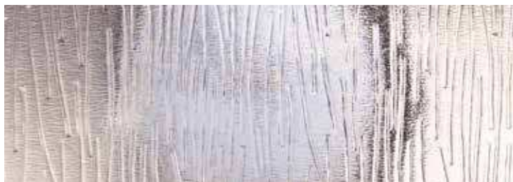
Charcoal Sticks™ Privacy Level 4