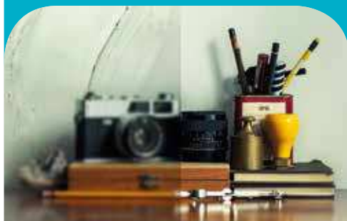
Privacy Level 1