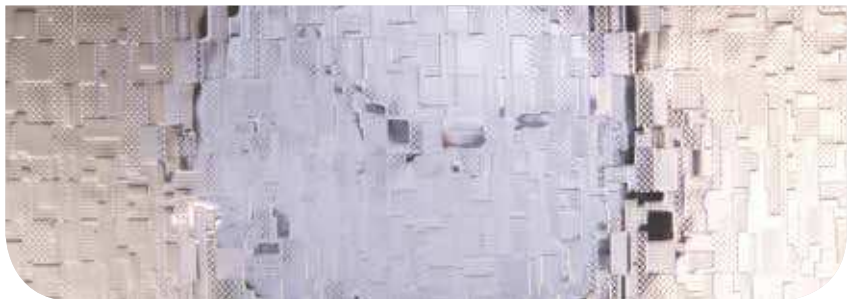
Digital™ Privacy Level 3