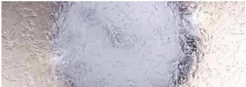
Oak™ Privacy Level 4