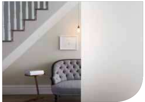
Pilkington Optifloat™ Opal Privacy Level 5