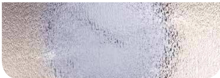
Contora™ Privacy Level 4