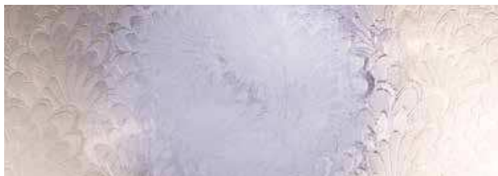
Pelerine™ Privacy Level 5