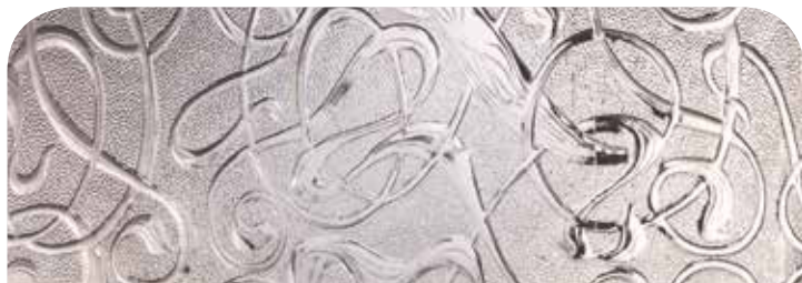
Everglade™ Privacy Level 5

Choose from a wide range of great Pilkington designs